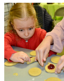
● Purim: costumed revelry & hamantaschen!