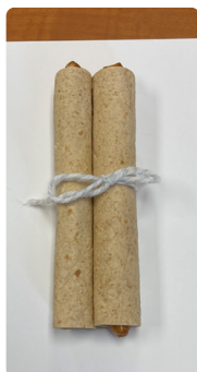
● Students craft sukkahs and Torah scrolls!