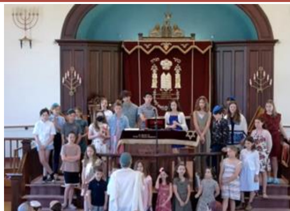
Photo above taken from the Convocation Zoom recording.

email for directions on enrolling students for the 2023 - 2024 school year.