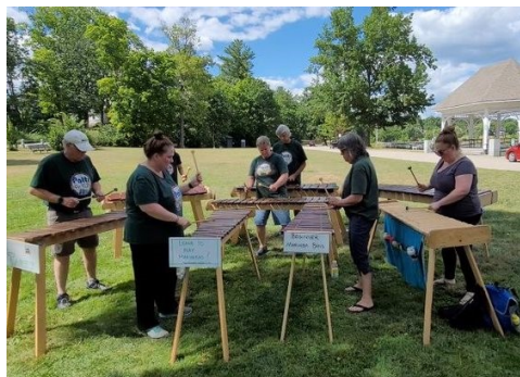
Outdoor marimba class in Stratham, NH,

The Arts Review Team is partnering with the Hebrew School for a spring exhibit by children and young teens. Entries are welcome on the themes of Holidays, Important Events, and Nature.