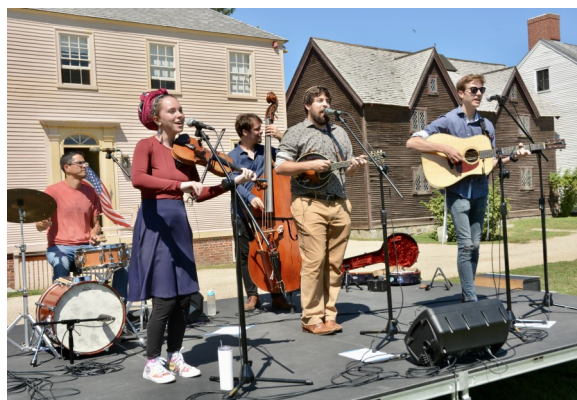
"Jewish Bluegrass" band Kol Kahol performs at the Back to Shul Festival on August 28.