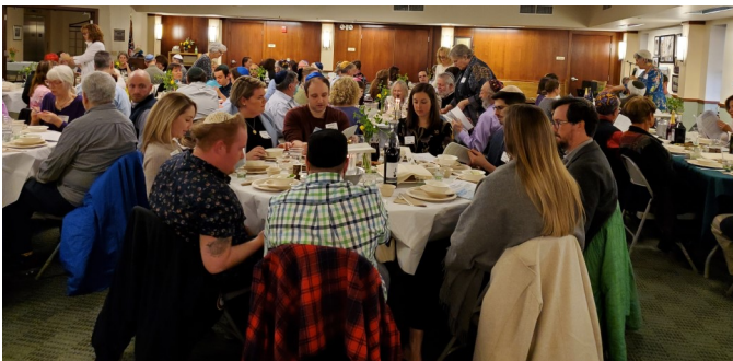
Celebrating Passover with the community, see p. 8