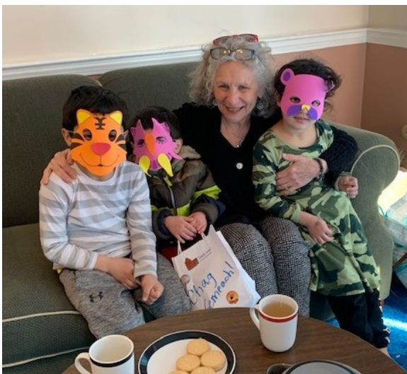
The Afghan family enjoyed Purim treats and masks provided by Temple Israel members.

BEWARE... plastic also can be brought into the building (usually as soda bottles and cookie containers) and plastic cannot be composted. Plastic can be identified by looking at the label (usually on the bottom of the container) and will show a number from 1-5. Make sure to check before you chuck!