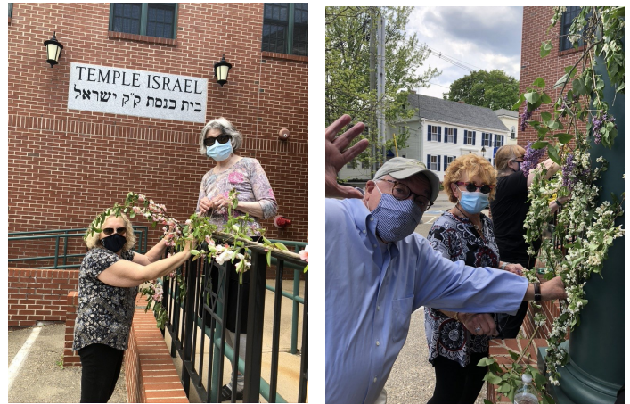
Decorating the outdoor bimah, erev Shavuot!