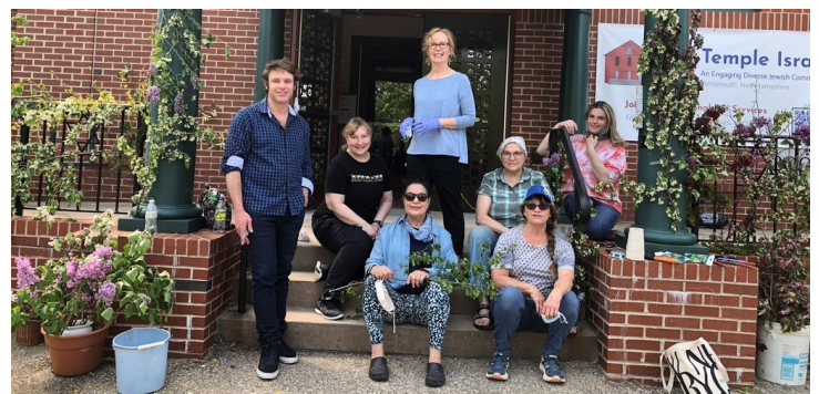
(Masks down for the photo op)