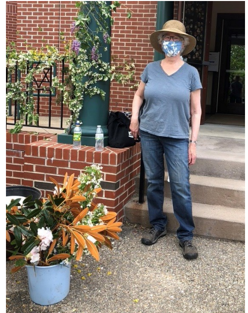
Decorating the Court Street entry in preparation for Shavuot.

The Ritual Committee is working hard to plan meaningful, joyful Shabbat and holiday observances at Temple Israel. We want your participation! If you have ideas for new types of religious services or holiday observances, if you want to help with planning, or if you are interested in chanting Torah or haftarah, leading part of a service, or giving a drash , we want to hear from you! You can reach me via email at ritual@templeisraelnh.org .