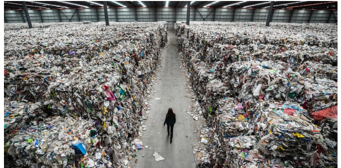
Shades of Raiders of the Lost Ark...

Plastic production is not carbon neutral. In addition to electricity and transportation inputs (let's say 2%), about 4 percent of the world's annual oil production of some 84.5 million barrels per day is used as plastic feedstock and another 4% or so provides the energy to transform that feedstock into useable plastic material. That means by 2050, twenty percent of our carbon footprint would be devoted to plastic production if the world's carbon footprint remains the same. If the carbon footprint is reduced, the proportion for plastic production would only increase.