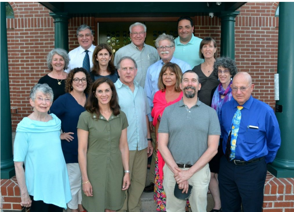
Temple Israel Board of Directors (July 2019) from left to right.