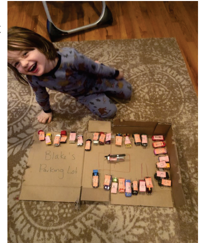
Learning the alphabet while parking cars at home!