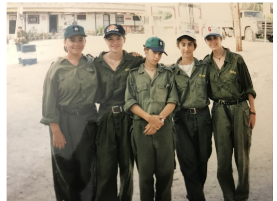
Photo: Gadna, Israel, 1993, at a week- long Israeli Army simulation for American teens. (I'm on the far right.)

Scholarship funds are available, both from Temple Israel and from the Jewish Federation of NH, to help mitigate the cost of sending our teens to Israel. A variety of different programs are offered through USY, NFTY, BBYO, Jewish summer camps like the Cohen Camps, Camp Yavneh, Camp Young Judea, and so many more. There are shorter trips and longer ones; some trips stop in Europe first, and most visit Israel only. There is a trip for everyone. And there is the amazing opportunity to take a free Birthright visit once in college. Thankfully, going to Israel in high school does not prohibit a return trip via Birthright in the future. I encourage each of you to try to find a path towards visiting our homeland and helping your kids to do so too. The more trips we take to Israel, the more connected we are to our past and our future.