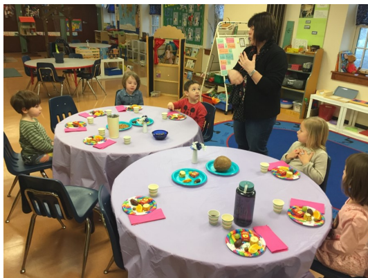
Getting ready for the Tu BiShvat Seder

We learned what plants and trees need to grow: soil, water, and sunlight. We examined a tree cutting to count the rings and determine the tree’s age. We used our creative side to add leaves and flowers to a tree, like the almond trees seen in Israel.