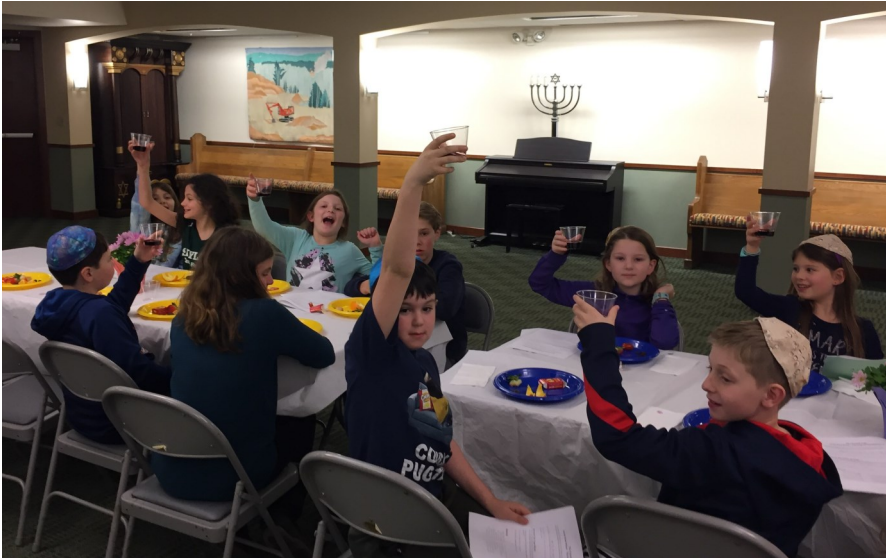
Hebrew School students enjoy the Tu BiShvat Seder on February 5.