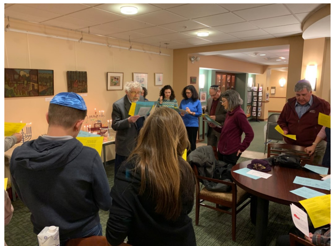
Singing Hanukkah songs in the Shmoozatorium.