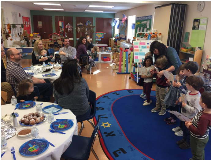
Celebrating in the classroom.